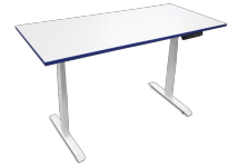
LT-180 BS-040107-HK Height adjustable desk