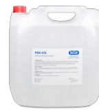
PDS-10L BS-040107-FK DNA/RNA Decontamination Solution 10l