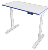
LT-120 BS-040107-EK Height adjustable desk